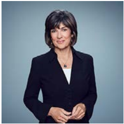
Christiane Amanpour, CNN Chief International Correspondent, Host of Amanpour & Company