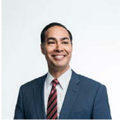
Julián Castro, 16th Secretary of Housing and Urban Development (Obama), former Mayor of San Antonio, TX