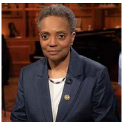
The Honorable Lori E. Lightfoot, 56th Mayor, City of Chicago