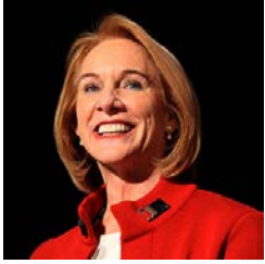
The Honorable Jenny A. Durkan, City of Seattle, WA